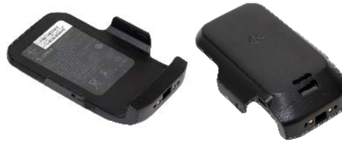
Optional PowerPack Battery BTRY-TC2X-PRPK1-01